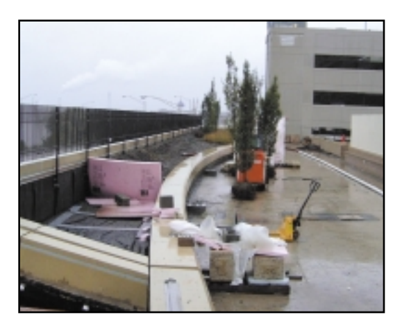
Connecticut convention Center, Hartford, CT. 9th floor walkway from the convention center to the parking garage.

SoilMatrix is a lightweight, ceramic material produced by expanding and