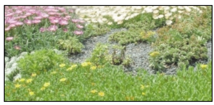
Sedums flourishing in extensive SOILMatrix blend

Designers can count on SOILMatrix to be predictable, stable and highly dependable for the duration of the greenroof. The planting media mixture will vary depending on the climate region, application, aggregate and types of plantings specified. For optimal results it is essential to consult with the SOILMatrix supplier during the design phase of the project.