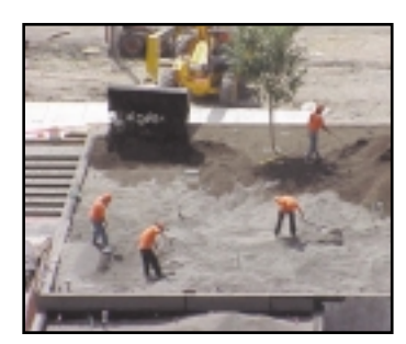
SOILMatrix being installed at LDS Conference Center

The use of this environmentally friendly ceramic material in greenroof design helps address important issues such as managing storm water runoff, improving water quality, reducing urban heat, conserving energy, lowering dead load and increasing green space.