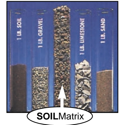
Tubes containing equal weights of soil, gravel, SOILMatrix, limestone and sand to demonstrate the difference in relative volume.

Natural sand and soil are heavy. They frequently require that structural modifications be made to the project's design. Native soils have silts and clays that may clog the filter materials or drainage layers and reduce effectiveness. The physical properties of natural volcanic aggregates vary widely with source and location. Natural materials may degrade and compact over time, and require additions to or replacement of planting media. Some horticultural products used in greenhouses and container planting, such as vermiculite and perlite, are extremely light in weight and do not offer adequate anchorage and support for larger plants. In exterior applications vermiculite and perlite often float to the top of the planting media where they can be carried away by wind or water.