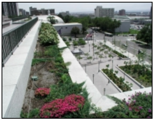
Perimeter planting on roof of LDS Conference Center in Salt Lake City, UT.