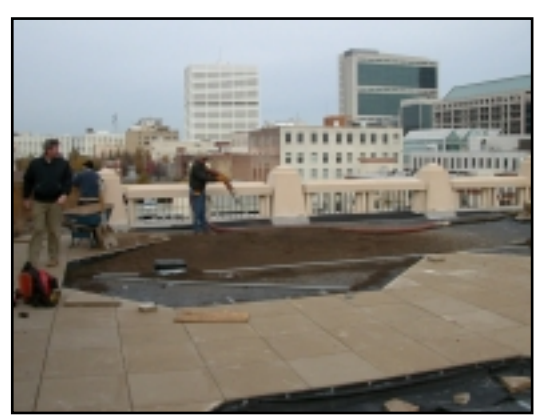
SOILMatrix installed by blowing equipment atop six-story Atlanta City Hall