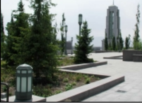
2 views of greenroof at LDS Conference Center, Salt Lake City, UT