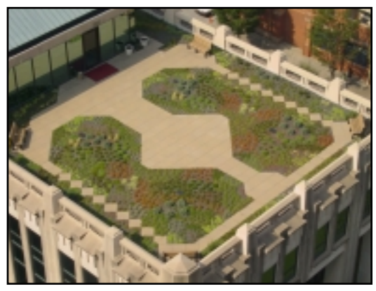
Extensive greenroof garden, City Hall, Atlanta, GA, 2004