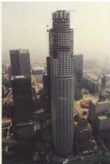
First Interstate World Trade Center: Los Angeles, California (75 Stories) Architect: I.M. Pei & Partners Structural Engineer: CBM Engineers, Inc. General Contractor: Turner Construction Company